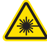
Laser radiation warning