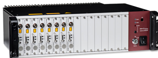
Koheras ACOUSTIK system